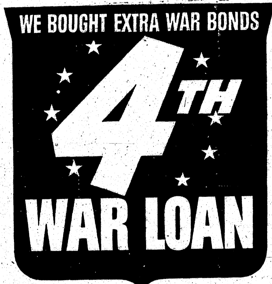
Every patriotic home in America will want to display this emblem. Paste it on your front door or on a window to show that you have done your part in the 4th War Loan.