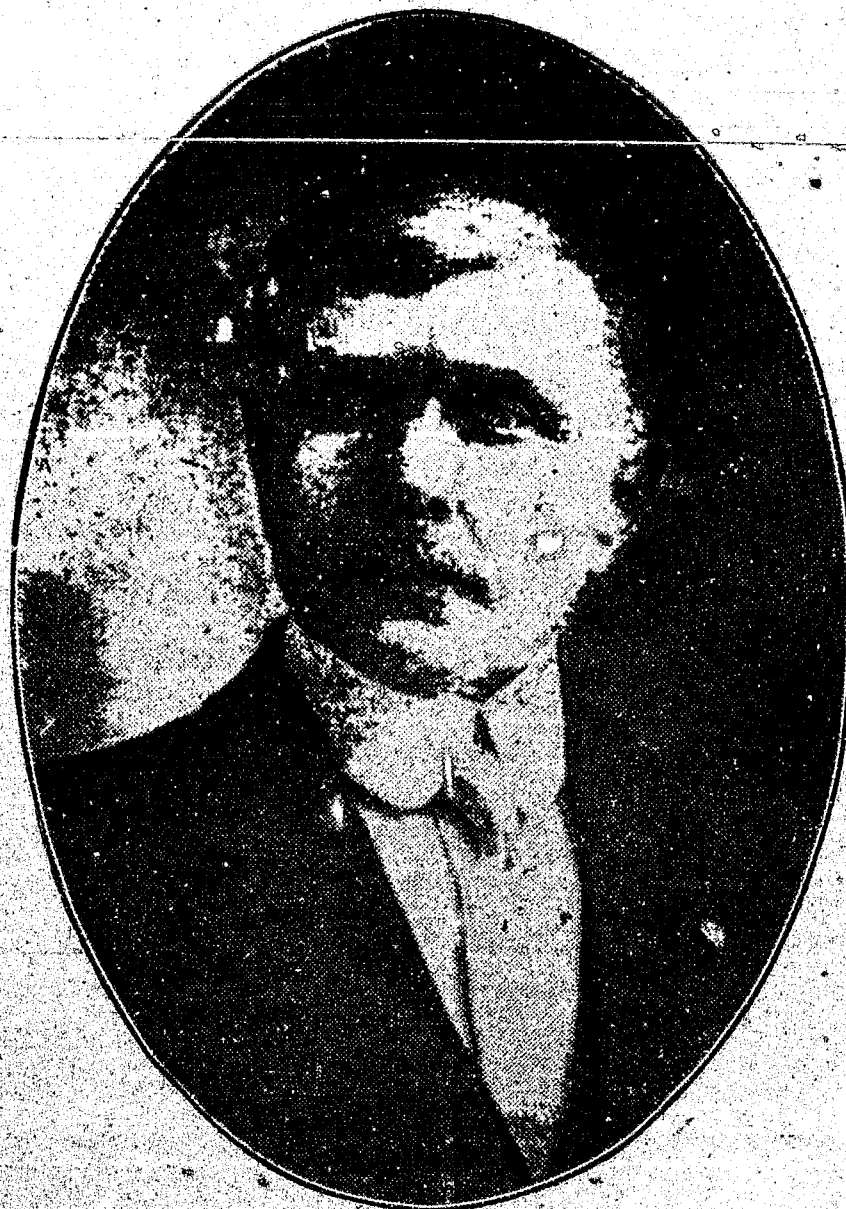
CANDIDATE FOR REPRESENTATIVE.