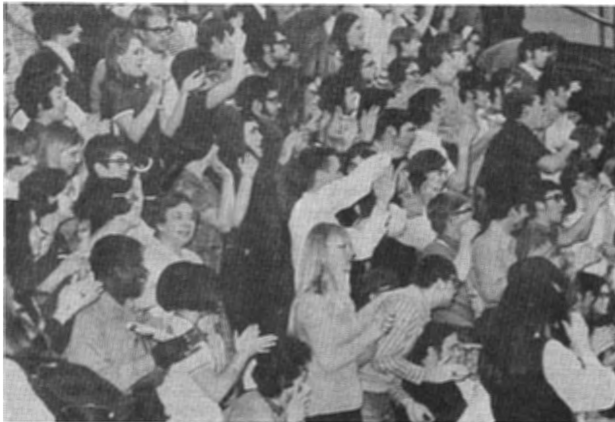
CEDARVILLE FANS fire-up as action quickens in a home game against Marion. Be there for the next action!

"Come out of your shell and join in the winter fun."