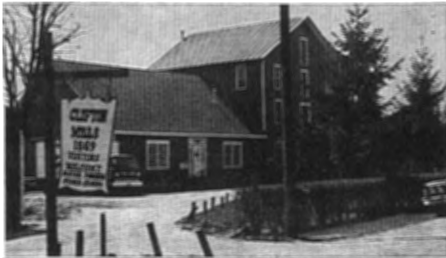
The Clifton Mills — just off Rt. 72 in Clifton, Ohio.

My opinion is that you'll like the Colonial Hideaway. The surroundings are pleasant with a relaxed and enjoyable atmosphere for dining. If you plan to dine on the weekend, better call for reservations. Until next issue, bon appetite.